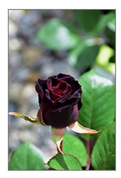
Black Baccara Rose flower buds

1232 Canal Street New Smyrna Beach, FL 32168 Phone: 386-428-7298 Website: www.lindleysgardencenter.com