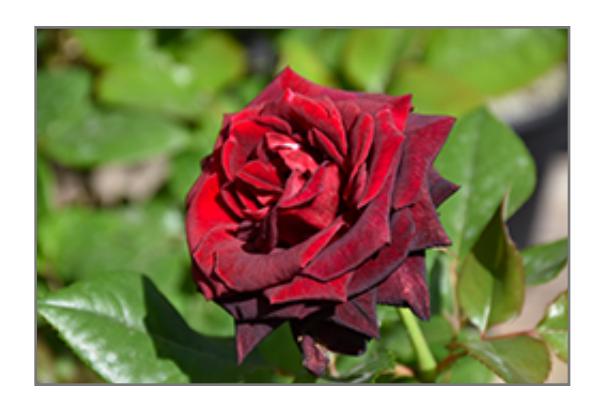
Black Baccara Rose flowers

Black Baccara Rose is recommended for the following landscape applications;