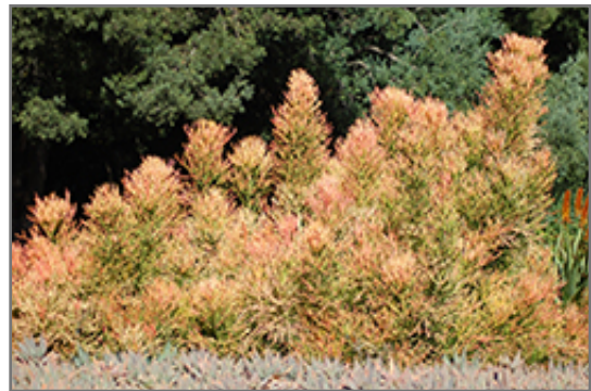
Pencil Cactus