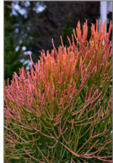
Pencil Cactus foliage