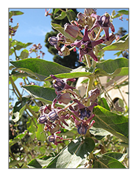
Giant Milkweed flowers