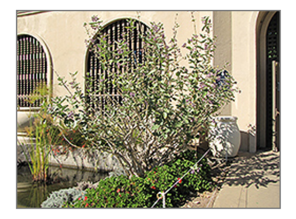
Giant Milkweed in bloom

1232 Canal Street New Smyrna Beach, FL 32168 Phone: 386-428-7298 Website: www.lindleysgardencenter.com