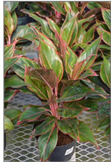
Siam Aurora Chinese Evergreen in full