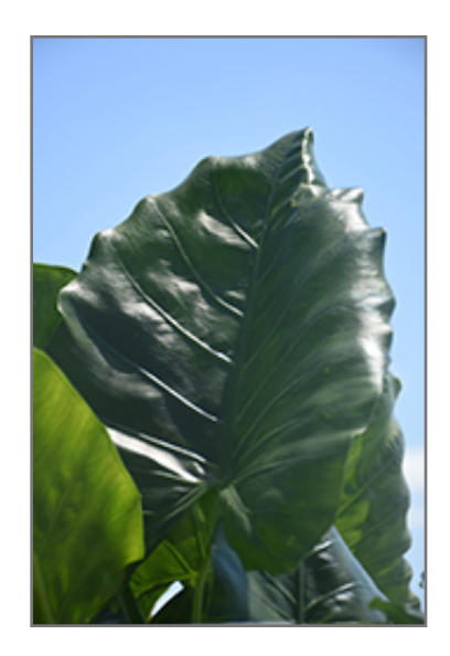
Borneo Giant Elephant's Ear foliage

1232 Canal Street New Smyrna Beach, FL 32168 Phone: 386-428-7298 Website: www.lindleysgardencenter.com