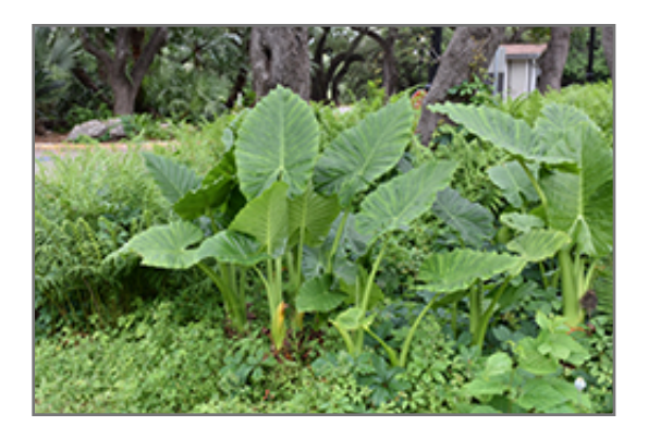
Borneo Giant Elephant's Ear