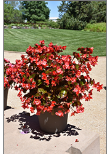
Megawatt Red Bronze Leaf Begonia flowers

Megawatt Red Bronze Leaf Begonia is a fine choice for the garden, but it is also a good selection for planting in outdoor containers and hanging baskets. With its upright habit of growth, it is best suited for use as a 'thriller' in the 'spiller-thriller-filler' container combination; plant it near the center of the pot, surrounded by smaller plants and those that spill over the edges. It is even sizeable enough that it can be grown alone in a suitable container. Note that when growing plants in outdoor containers and baskets, they may require more frequent waterings than they would in the yard or garden.