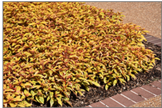
Lime Sizzler Firebush