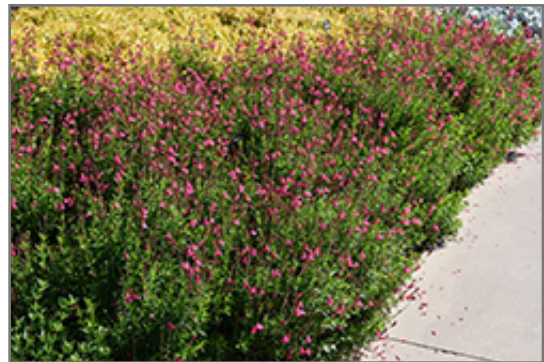
Pink Autumn Salvia in bloom