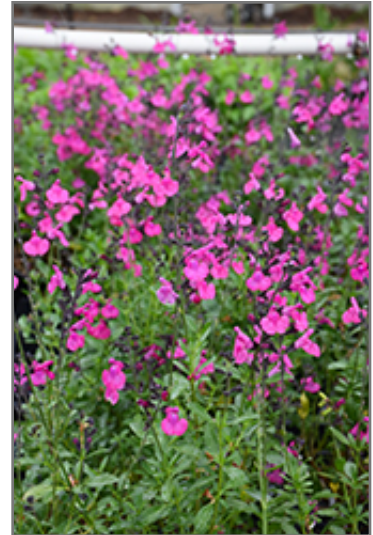
Raspberry Autumn Salvia flowers

Raspberry Autumn Salvia is recommended for the following landscape applications;