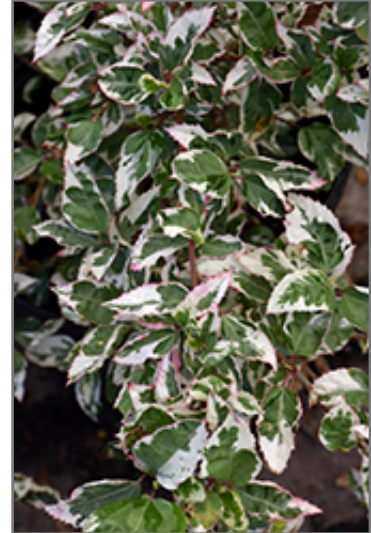
Snow Queen Hibiscus foliage

Snow Queen Hibiscus makes a fine choice for the outdoor landscape, but it is also well-suited for use in outdoor pots and containers. With its upright habit of growth, it is best suited for use as a 'thriller' in the 'spiller-thriller-filler' container combination; plant it near the center of the pot, surrounded by smaller plants and those that spill over the edges. It is even sizeable enough that it can be grown alone in a suitable container. Note that when grown in a container, it may not perform exactly as indicated on the tag - this is to be expected. Also note that when growing plants in outdoor containers and baskets, they may require more frequent waterings than they would in the yard or garden.