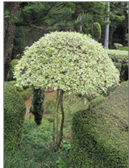
Snow Queen Hibiscus