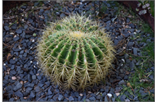
Golden Barrel Cactus

Golden Barrel Cactus is a succulent evergreen plant. It is a member of the cactus family, which are grown primarily for their characteristic shapes, their interesting features and textures, and their high tolerance for hot, dry growing environments. Like all cacti, it doesn't actually have leaves, but rather modified succulent stems that comprise the bulk of the plant, and which are designed to hold water for long periods of time. This particular cactus is valued for its distinctive barrel shape, and usually grows as a single spiny ribbed green stem. This plant has yellow cup-shaped flowers held atop the stems from late spring to early summer, which are interesting on close inspection.