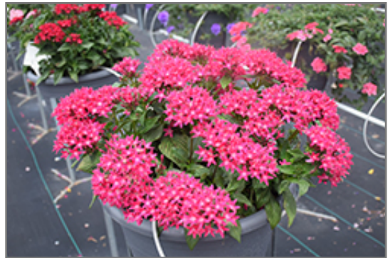
Sunstar Rose Egyptian Pentas in bloom