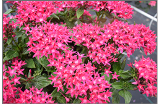
Sunstar Rose Egyptian Pentas flowers

Sunstar Rose Egyptian Pentas is recommended for the following landscape applications;