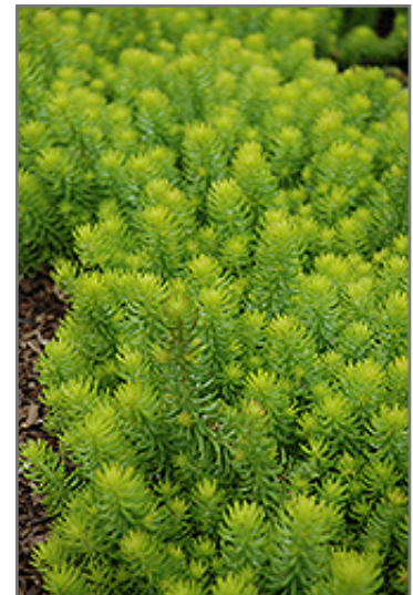
Angelina Sedum foliage