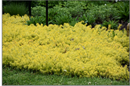
Angelina Sedum

This plant does best in full sun to partial shade. It prefers dry to average moisture levels with very well-drained soil, and will often die in standing water. It is considered to be drought-tolerant, and thus makes an ideal choice for a low-water garden or xeriscape application. It is not particular as to soil pH, but grows best in poor soils, and is able to handle environmental salt. It is highly tolerant of urban pollution and will even thrive in inner city environments. This is a selected variety of a species not originally from North America. It can be propagated by division; however, as a cultivated variety, be aware that it may be subject to certain restrictions or prohibitions on propagation.