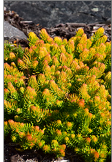
Angelina Sedum foliage