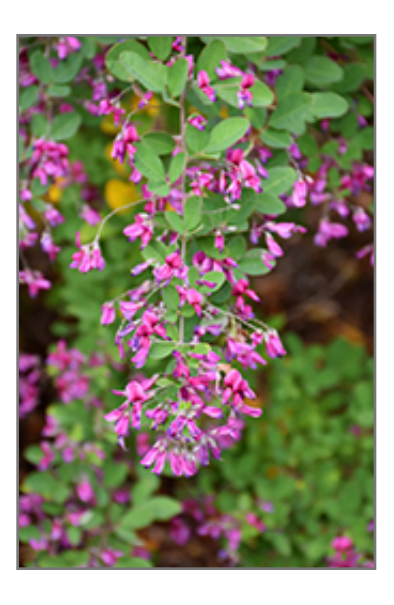
Little Volcano Bush Clover flowers

Little Volcano Bush Clover is recommended for the following landscape applications;