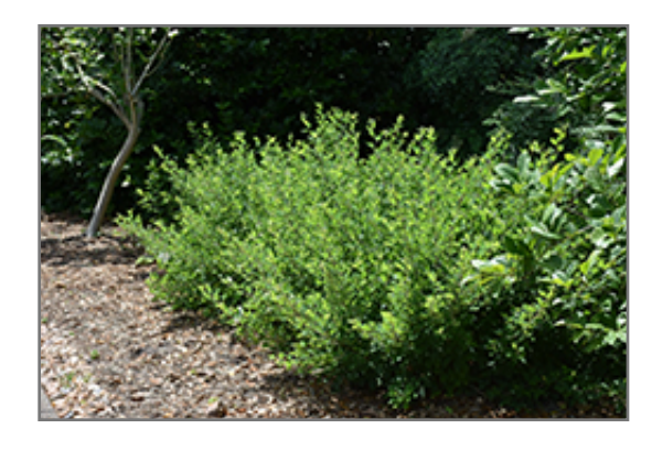
Little Volcano Bush Clover

Little Volcano Bush Clover will grow to be about 6 feet tall at maturity, with a spread of 10 feet. It tends to fill out right to the ground and therefore doesn't necessarily require facer plants in front, and is suitable for planting under power lines. It grows at a slow rate, and under ideal conditions can be expected to live for approximately 10 years.