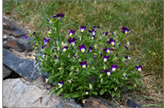
Johnny Jump-Up in bloom

Johnny Jump-Up will grow to be only 4 inches tall at maturity extending to 6 inches tall with the flowers, with a spread of 6 inches. When grown in masses or used as a bedding plant, individual plants should be spaced approximately 5 inches apart. It grows at a fast rate, and tends to be biennial, meaning that it puts on vegetative growth the first year, flowers the second, and then dies. However, this species tends to self-seed and will thereby endure for years in the garden if allowed. As an herbaceous perennial, this plant will usually die back to the crown each winter, and will regrow from the base each spring. Be careful not to disturb the crown in late winter when it may not be readily seen!