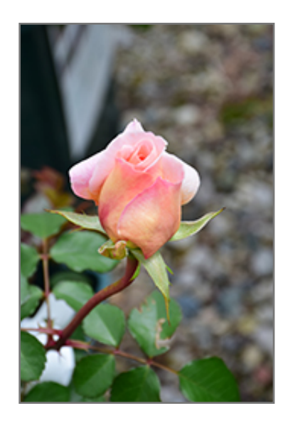
Abraham Darby Rose flower buds