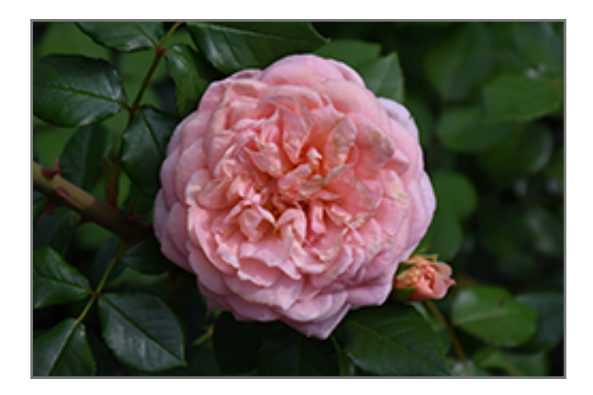
Abraham Darby Rose flowers