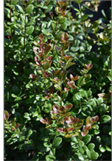
Simpson's Stopper foliage