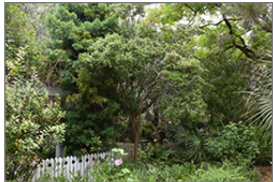
Simpson's Stopper in bloom