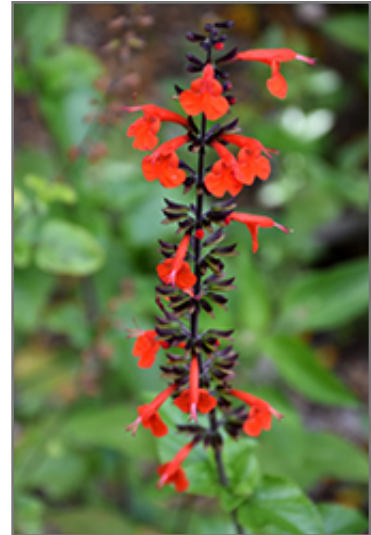
Red Tropical Sage flowers

Red Tropical Sage is recommended for the following landscape applications;