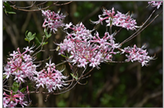
Pinxter Azalea flowers

Pinxter Azalea will grow to be about 15 feet tall at maturity, with a spread of 15 feet. It tends to be a little leggy, with a typical clearance of 1 foot from the ground, and is suitable for planting under power lines. It grows at a slow rate, and under ideal conditions can be expected to live for 40 years or more.