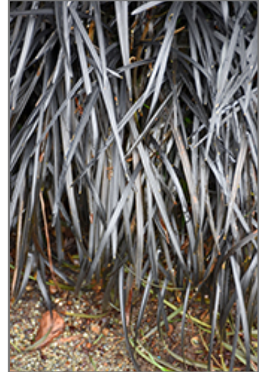
Black Mondo Grass foliage

* This is a 'special order' plant - contact store for details