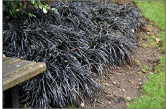
Black Mondo Grass