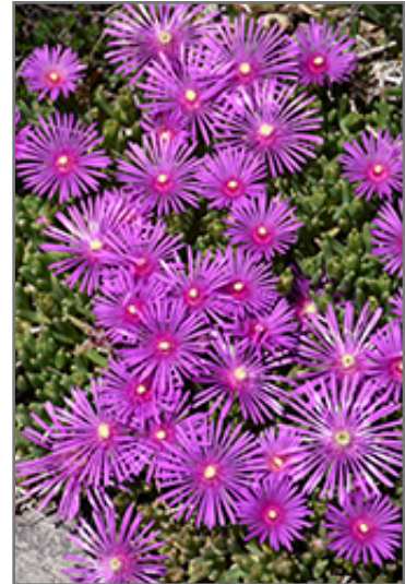
Purple Ice Plant flowers

Purple Ice Plant is recommended for the following landscape applications;