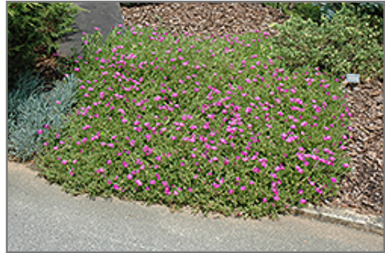
Purple Ice Plant in bloom

Purple Ice Plant will grow to be only 2 inches tall at maturity extending to 3 inches tall with the flowers, with a spread of 24 inches. Its foliage tends to remain low and dense right to the ground. It grows at a fast rate, and under ideal conditions can be expected to live for approximately 5 years. As an evergreen perennial, this plant will typically keep its form and foliage year-round.