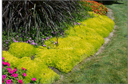
Lemon Coral Sedum

This plant does best in full sun to partial shade. It prefers dry to average moisture levels with very well-drained soil, and will often die in standing water. It is considered to be drought-tolerant, and thus makes an ideal choice for a low-water garden or xeriscape application. It is not particular as to soil pH, but grows best in poor soils, and is able to handle environmental salt. It is highly tolerant of urban pollution and will even thrive in inner city environments. This is a selected variety of a species not originally from North America. It can be propagated by division; however, as a cultivated variety, be aware that it may be subject to certain restrictions or prohibitions on propagation.