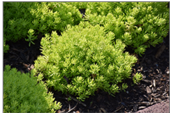
Lemon Coral Sedum