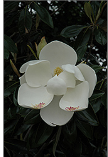
Teddy Bear Magnolia flowers