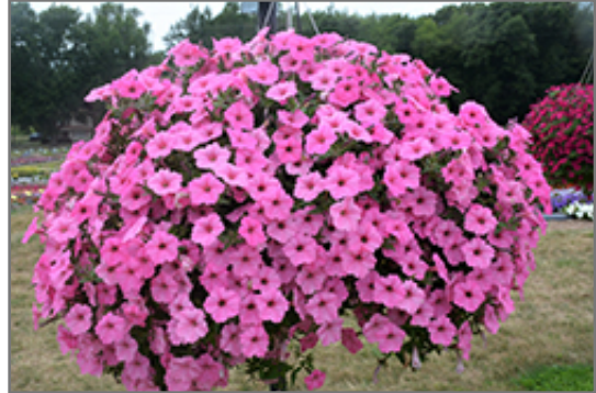
Supertunia Vista Bubblegum Petunia in bloom

Supertunia Vista Bubblegum Petunia is a fine choice for the garden, but it is also a good selection for planting in outdoor containers and hanging baskets. Because of its trailing habit of growth, it is ideally suited for use as a 'spiller' in the 'spiller-thriller-filler' container combination; plant it near the edges where it can spill gracefully over the pot. Note that when growing plants in outdoor containers and baskets, they may require more frequent waterings than they would in the yard or garden.