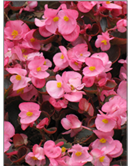
Bada Boom Pink Begonia flowers