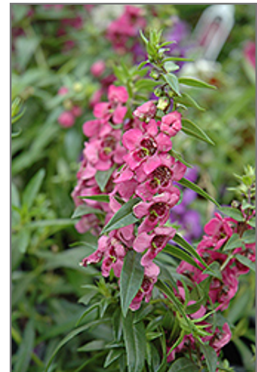
Pink Angelonia flowers