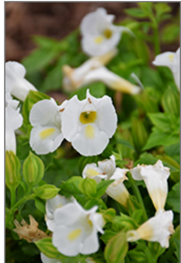
Catalina White Linen Torenia flowers