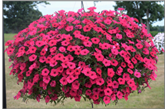
Supertunia Vista Fuchsia Petunia in bloom