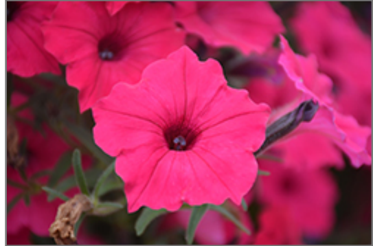
Supertunia Vista Fuchsia Petunia flowers