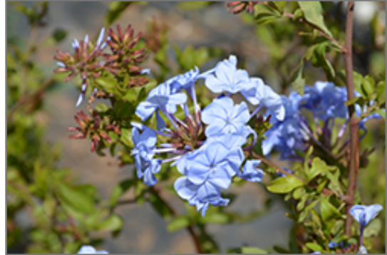
Imperial Blue Plumbago flowers

Imperial Blue Plumbago is recommended for the following landscape applications;