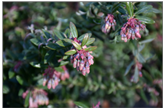
Darrow's Blueberry flowers