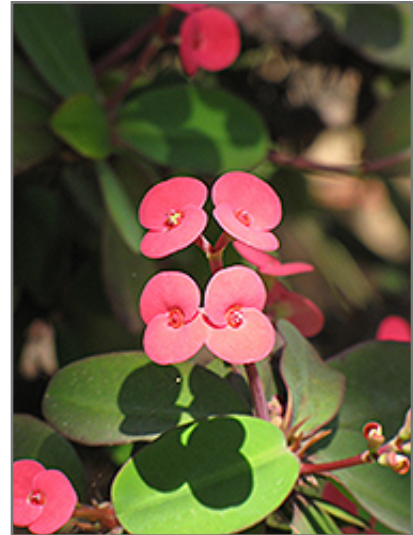
Crown Of Thorns flowers

Crown Of Thorns is recommended for the following landscape applications;