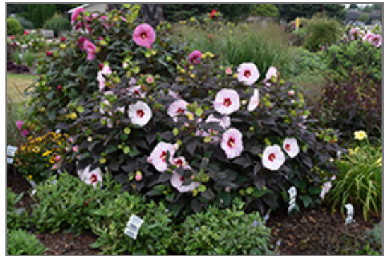
Summerific Perfect Storm Hibiscus in bloom