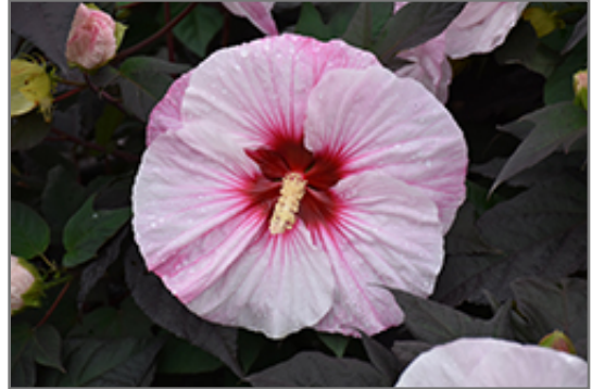
Summerific Perfect Storm Hibiscus flowers

Summerific Perfect Storm Hibiscus is recommended for the following landscape applications;