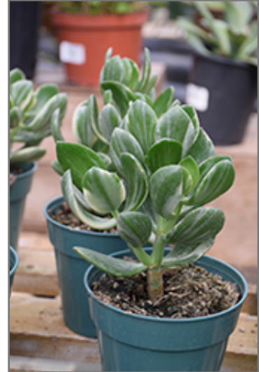
Variegated Jade Plant in full

This is a multi-stemmed evergreen houseplant with an upright spreading habit of growth. This plant can be pruned at any time to keep it looking its best.