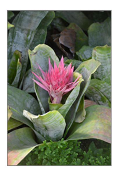
Urn Plant in bloom