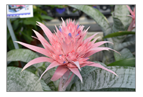
Urn Plant flowers

This is an herbaceous evergreen houseplant with a shapely form and gracefully arching foliage. Its relatively coarse texture stands it apart from other indoor plants with finer foliage. This plant should never be pruned unless absolutely necessary, as it tends not to take pruning well.