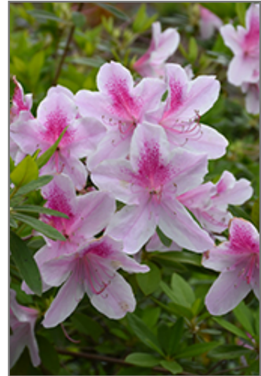
George Taber Azalea flowers