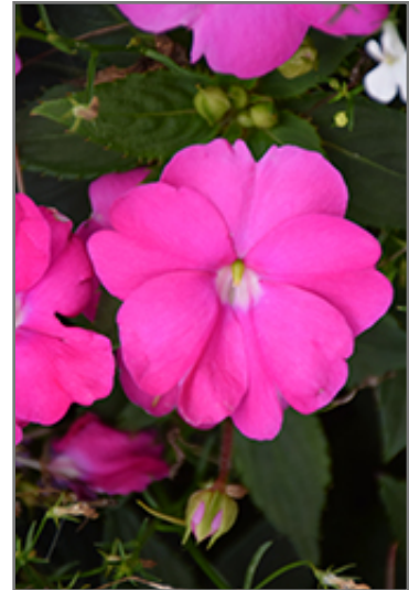
SunPatiens Compact Neon Pink New Guinea Impatiens flowers

This plant will require occasional maintenance and upkeep, and should not require much pruning, except when necessary, such as to remove dieback. It is a good choice for attracting bees and butterflies to your yard. It has no significant negative characteristics.