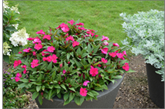
SunPatiens Compact Neon Pink New Guinea Impatiens in bloom

SunPatiens Compact Neon Pink New Guinea Impatiens is a fine choice for the garden, but it is also a good selection for planting in outdoor containers and hanging baskets. It can be used either as 'filler' or as a 'thriller' in the 'spiller-thriller-filler' container combination, depending on the height and form of the other plants used in the container planting. It is even sizeable enough that it can be grown alone in a suitable container. Note that when growing plants in outdoor containers and baskets, they may require more frequent waterings than they would in the yard or garden.