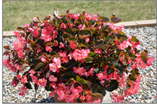
Megawatt Pink Bronze Leaf Begonia in bloom