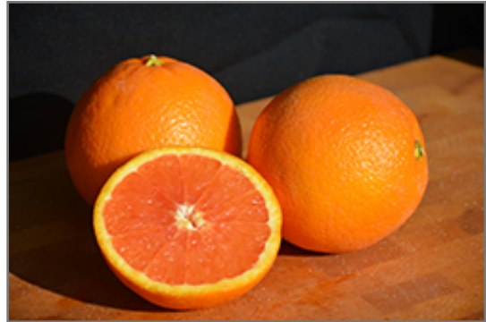
Red Navel Orange fruit and flesh

Red Navel Orange features showy clusters of fragrant white star-shaped flowers at the ends of the branches in early spring. It has attractive dark green evergreen foliage. The glossy oval leaves are highly ornamental and remain dark green throughout the winter. It features an abundance of magnificent orange berries from late fall to late winter.