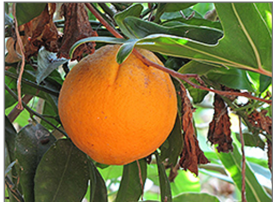
Red Navel Orange fruit