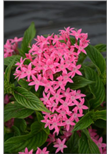
Lucky Star Pink Pentas flowers

Lucky Star Pink Pentas is recommended for the following landscape applications;