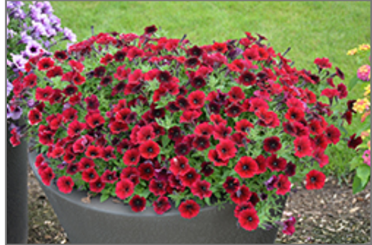
Supertunia Black Cherry Petunia in bloom

Supertunia Black Cherry Petunia is a fine choice for the garden, but it is also a good selection for planting in outdoor containers and hanging baskets. Because of its trailing habit of growth, it is ideally suited for use as a 'spiller' in the 'spiller-thriller-filler' container combination; plant it near the edges where it can spill gracefully over the pot. Note that when growing plants in outdoor containers and baskets, they may require more frequent waterings than they would in the yard or garden.