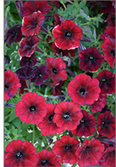
Supertunia Black Cherry Petunia flowers

This plant will require occasional maintenance and upkeep. Trim off the flower heads after they fade and die to encourage more blooms late into the season. It is a good choice for attracting butterflies and hummingbirds to your yard, but is not particularly attractive to deer who tend to leave it alone in favor of tastier treats. It has no significant negative characteristics.