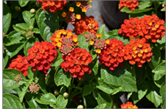
Hot Blooded Red Lantana flowers

This is a relatively low maintenance shrub, and should not require much pruning, except when necessary, such as to remove dieback. It is a good choice for attracting butterflies and hummingbirds to your yard, but is not particularly attractive to deer who tend to leave it alone in favor of tastier treats. It has no significant negative characteristics.