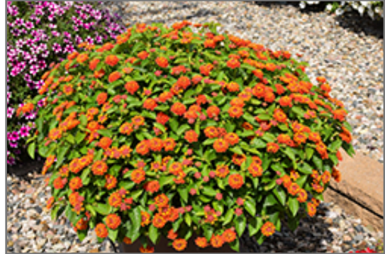
Hot Blooded Red Lantana in bloom

Hot Blooded Red Lantana makes a fine choice for the outdoor landscape, but it is also well-suited for use in outdoor containers and hanging baskets. It is often used as a 'filler' in the 'spiller-thriller-filler' container combination, providing a mass of flowers against which the thriller plants stand out. Note that when grown in a container, it may not perform exactly as indicated on the tag - this is to be expected. Also note that when growing plants in outdoor containers and baskets, they may require more frequent waterings than they would in the yard or garden.