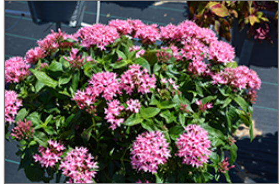
Lucky Star Deep Pink Pentas in bloom

Lucky Star Deep Pink Pentas will grow to be about 12 inches tall at maturity, with a spread of 14 inches. When grown in masses or used as a bedding plant, individual plants should be spaced approximately 10 inches apart. Its foliage tends to remain dense right to the ground, not requiring facer plants in front. This fast-growing annual will normally live for one full growing season, needing replacement the following year.