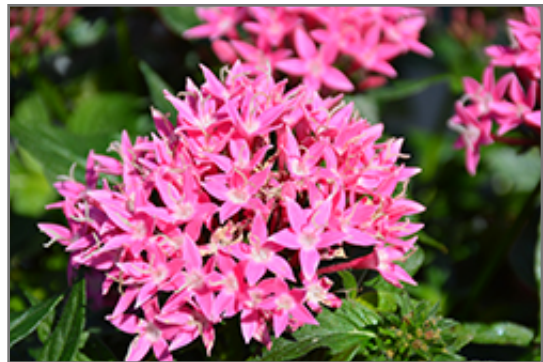
Lucky Star Deep Pink Pentas flowers