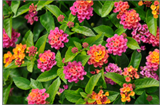
Bloomify Rose Lantana flowers

Bloomify Rose Lantana is recommended for the following landscape applications;