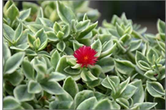
Variegated Baby Sun Rose flowers

Variegated Baby Sun Rose is recommended for the following landscape applications;