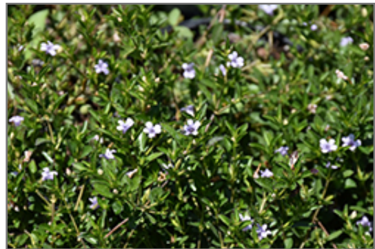
Swamp Twinflower flowers