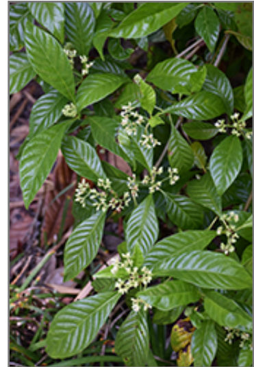
Florida Wild Coffee flowers

Florida Wild Coffee is recommended for the following landscape applications;