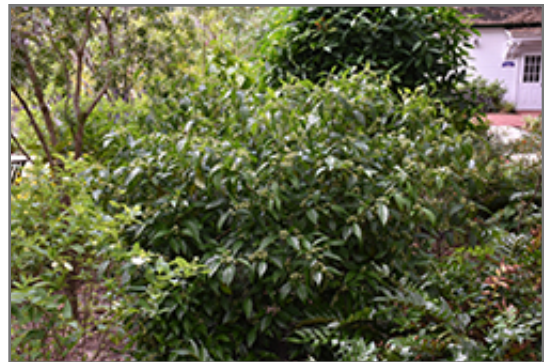
Little Psycho Wild Coffee flowers