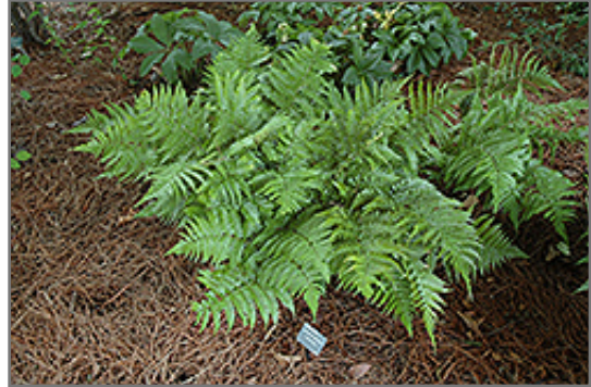
Autumn Fern

Autumn Fern will grow to be about 18 inches tall at maturity, with a spread of 18 inches. Its foliage tends to remain dense right to the ground, not requiring facer plants in front. It grows at a medium rate, and under ideal conditions can be expected to live for approximately 15 years. As an evergreen perennial, this plant will typically keep its form and foliage year-round.