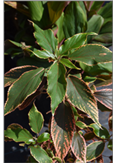
Bourbon Street Copper Plant foliage

Bourbon Street Copper Plant is recommended for the following landscape applications;