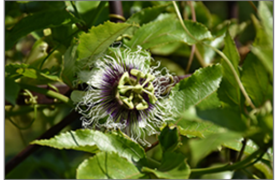
Possum Purple Passionfruit flowers

This is a multi-stemmed deciduous woody vine with a spreading, ground-hugging habit of growth. Its average texture blends into the landscape, but can be balanced by one or two finer or coarser trees or shrubs for an effective composition. This is a relatively low maintenance plant, and is best cleaned up in early spring before it resumes active growth for the season. It is a good choice for attracting birds, bees and butterflies to your yard. It has no significant negative characteristics.